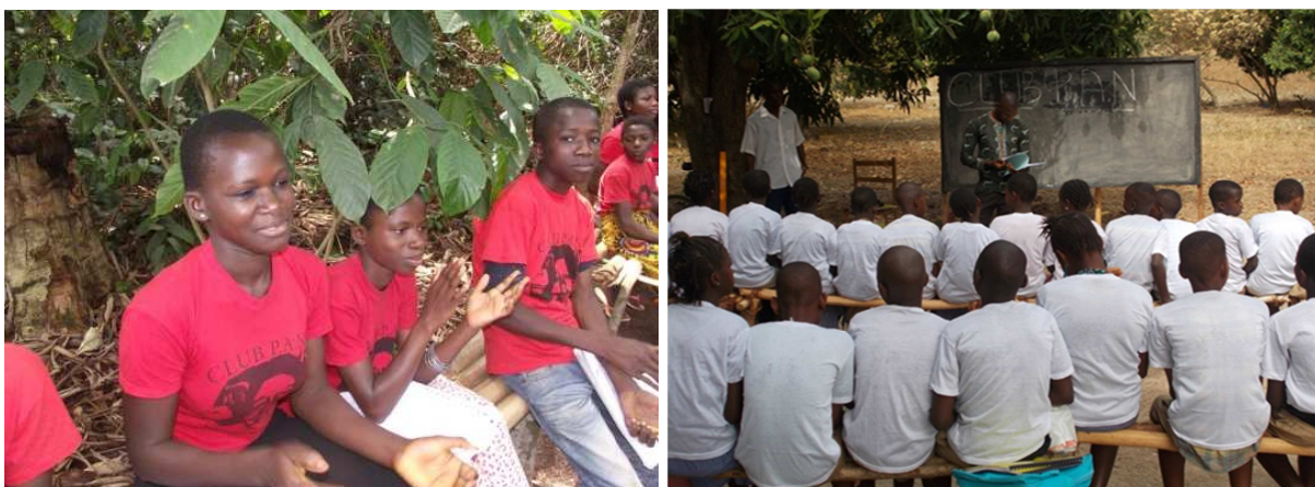
Club P.A.N. sessions in outdoor nature class rooms

Club P.A.N. sessions involved fact sheets, activities, role playing, songs and games with animal puppets which are based around a chosen theme. We aim to promote positive club spirit through interactive learning and essentially having fun. Each child that participated received a Club P.A.N. book and T-Shirt which means a lot to them. Some sessions focused on the concepts of sustainable resource use and the need for protected areas; others detail the natural history of various large protected mammals (like chimpanzees & elephants). We created a website: www.wildchimps.org/wcf/english/pan , and blog: http://clubpan.blogspot.com , which are updated regularly to highlight how fun and successful Club P.A.N. has been.