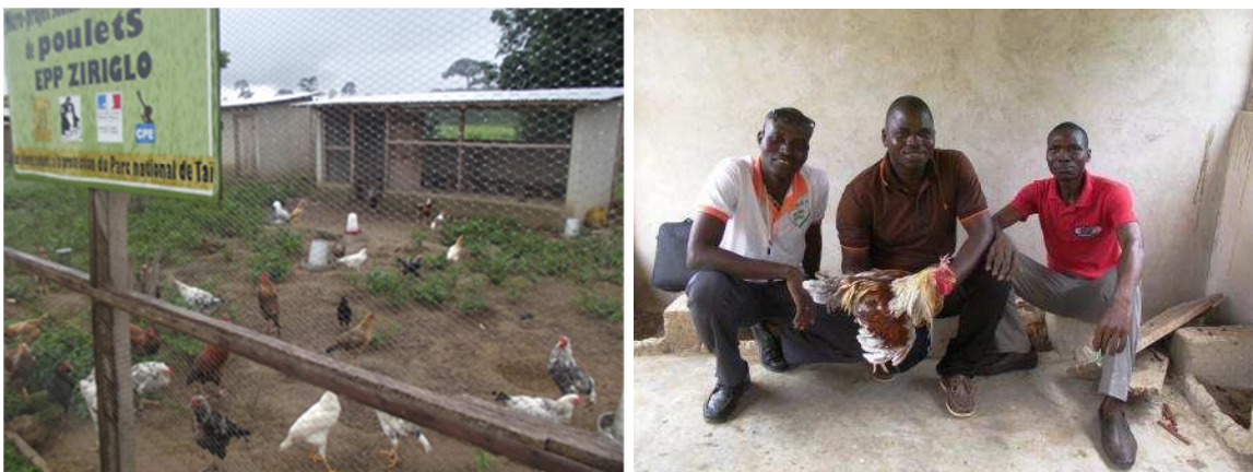
Club P.A.N. school micro-project chicken farm in Ziriglo