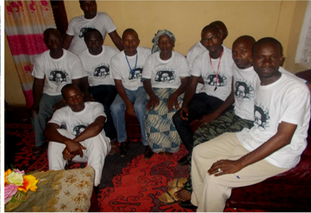
Club P.A.N. teachers and principals during their training in 2014