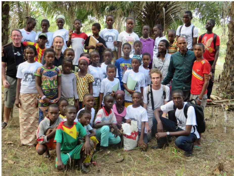
Club P.A.N. children in Guinea

To assure the protection of chimpanzees, the WCF will continue its important short and long-term programs. Short-term projects, such as increased anti-poaching patrols and other law-enforcement strategies aim to reduce the impact of bush-meat hunting on local wildlife populations. The long-term projects like public outreach and awareness-raising programs play a vital role in changing local attitudes towards the intrinsic value of wildlife. Conservation education is a priority long-term action for the conservation of chimpanzees and other wildlife (Kormos and Boesch, 2003). In 2007, WCF created nature clubs called "Club P.A.N." (Personnes, Animaux et Nature / People, Animals & Nature) for primary schools in West Africa. Club P.A.N.'s prior success led to the continuation of the programme for its eight year in Côte d'Ivoire and for the fifth year in Guinea.