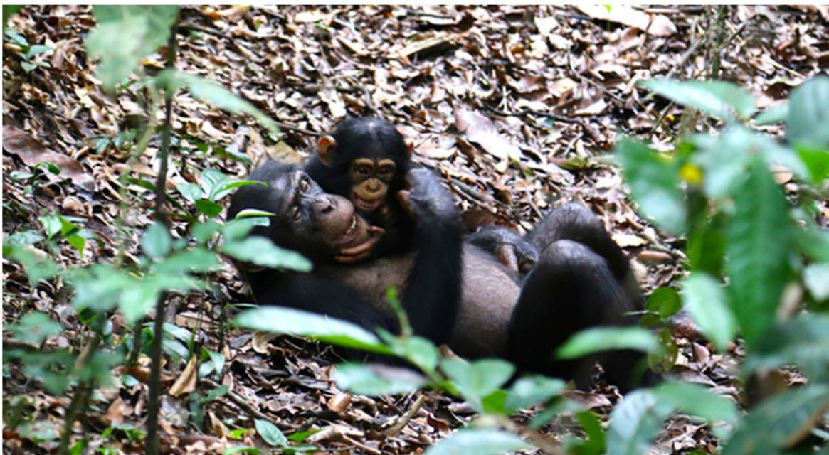
Wild chimpanzees from Taï National Park in Côte d'Ivoire

In order to curb the threats of illegal bush-meat hunting and consumption, WCF developed numerous alternative livelihood micro-projects aimed at providing alternative sources of protein such as poultry, goats, cane rats and snails. The school micro-projects provide both an educational activity for many children in the villages but also a means to support the development of the schools. In 2014/2015, WCF supported school micro-projects in Para and Adamakro (goats), Ziriglo (chickens), Petit Tiémé (grass-cutters), Sakré and Djouroutou (snails).