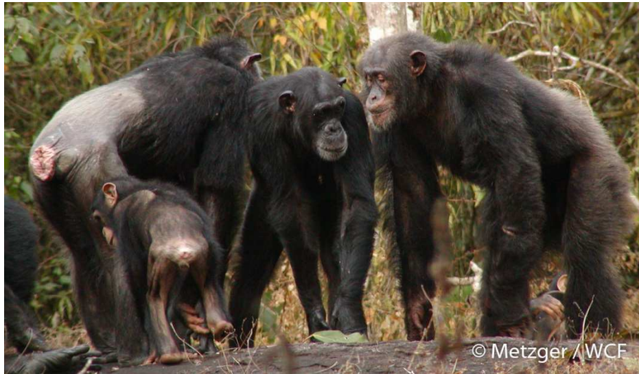
Wild chimpanzees from Taï National Park in Côte d'Ivoire

Ensure the long-term protection of viable populations of wild chimpanzees and their forest habitats throughout tropical Africa.