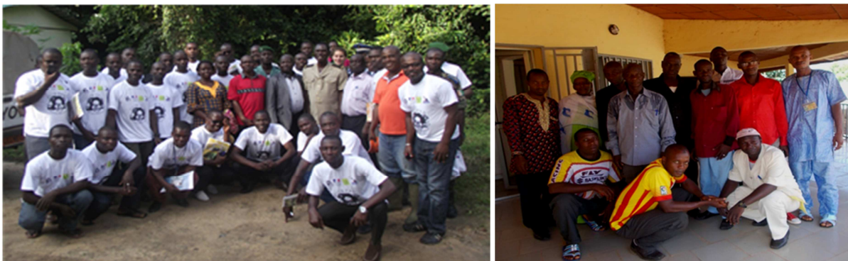
Club P.A.N. coordinators, teachers and principals during their training at the Ecological Research Station in Taï National Park, Côte d'Ivoire (left) and in Dabola, Guinea (right)