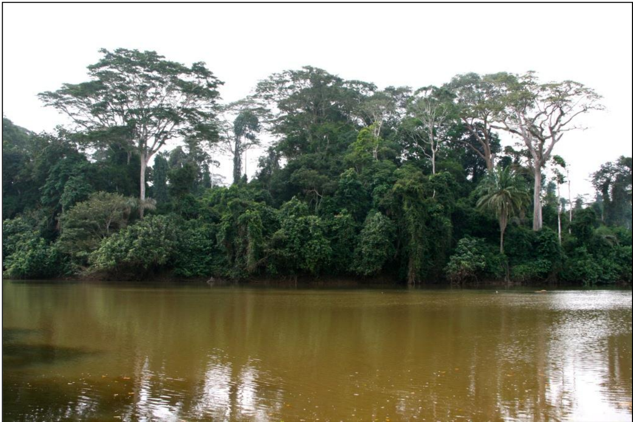
Grebo National Forest and the Cavally River

Sapo National Park : Founded in 1983, Sapo National Park (SNP) is Liberia's only national park and is the largest protected rainforest in the country. Located to the west of GNF, it is proposed to be connected to Tai and Grebo protected areas by a series of wildlife corridors. Conservation activities in the park effectively stopped during the civil conflicts of the 1990s and early 2000s, but have since slowly restarted; the park is now under the management of the government's Forestry Development Authority (FDA), which operates with the support of a number of international NGOs, including Fauna and Flora International (FFI).