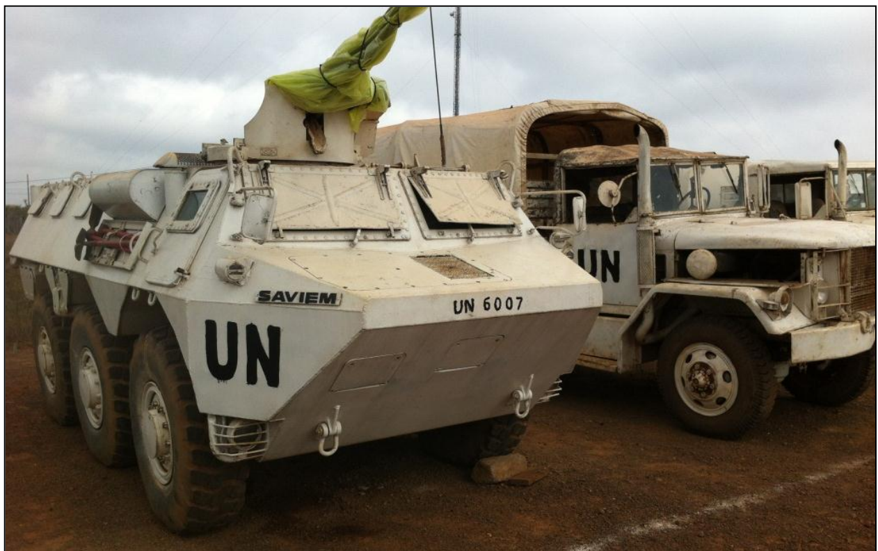
ONUCI maintains a base outside of the village of Tai

Progress remains slow on establishing transboundary collaboration between the two governments, in part due to the crisis, which delayed a number of conservation initiatives. Forestry and mining concessions in Liberia, granted in areas overlapping with the proposed transboundary ecosystem, pose a threat to the ecosystem, though forestry concessions are currently on hold while the Johnson Sirleaf administration continues to review the agreements and clean up corruption. Research is planned on how to bring Liberian and Ivorian conservation legislation more in line with each other to ease coordination on monitoring, research and stopping illegal activities (including the bushmeat trade); existing legislation is close, though a significant amount of capacity-building will be required on the Liberian side of the border. Liberia promised more collaboration and cooperation with Côte d'Ivoire in wake of the violence of the summer of 2012. It is hoped that cross-border collaboration can be used as a means of building confidence and peace between the two countries.