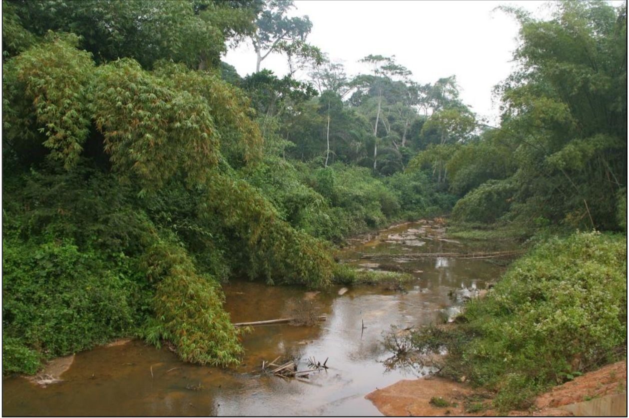
The Saro River, site of the proposed Tai-Grebo landscape corridor

Tai-Grebo corridor: The proposed northern corridor, passing by the village of Tai, will follow the N'Ze and Saro Rivers along a narrow stretch of land (approximately 3.5km) between the park and the Cavally River. Tai village, located between the two rivers, is estimated to have a population of between 6,000 and 8,000 inhabitants, and when counted with surrounding villages near the site, local population densities are high. There is a lot of cultivation in and around the corridor, focused on cocoa and rubber. There is less evidence of poaching in the north, but this could simply be a reflection of lower wildlife populations near the TG corridor. Electrification in the region is sporadic, but an improved connection to the national grid is envisaged by the end of 2013.