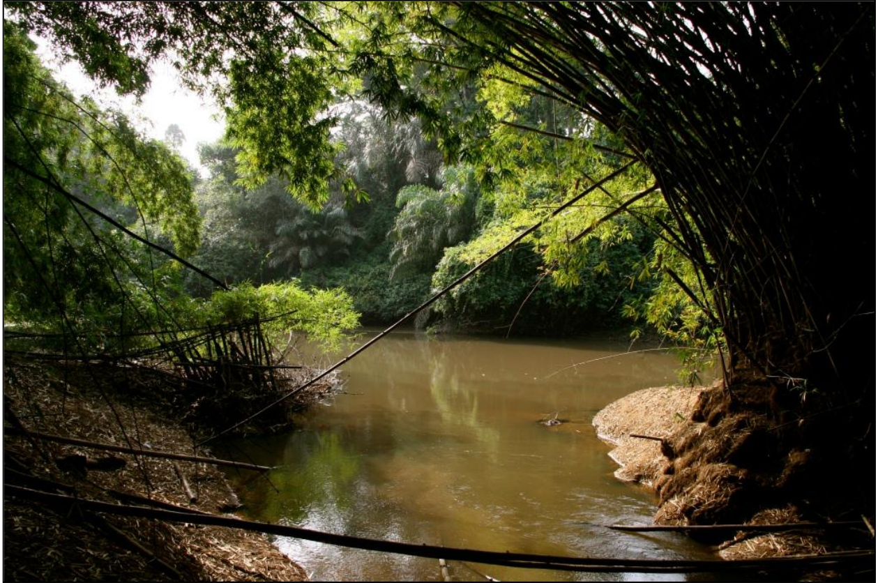
The Hana River, site of the proposed Djouroutou-Grebo landscape corridor

Djouroutou-Grebo corridor: The proposed southern corridor passes through the village of Djouroutou along the Hana River. It is significantly longer than the TG corridor: a stretch of approximately 16km of land will need to be protected. Population densities around this corridor are lower than with the TG corridor, as there is more land between the park and the Liberian border. Cocoa and palm are the dominant crops, and most cultivation is done by the immigrant community. Accessing this part of the country can be difficult due to poor road connections, particularly during the rainy season, making it difficult for farmers to access markets with their goods. The region is not connected to the national electricity grid, and must rely on generators for power.