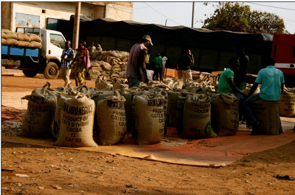
Suggested strategies include cocoa certification, agricultural extension services and farmer cooperatives