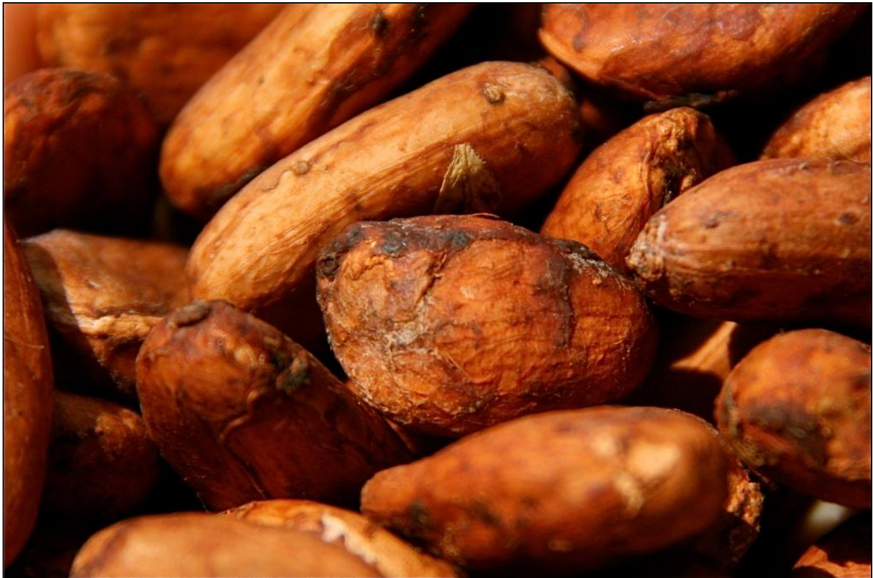
Côte d'Ivoire is the world's largest producer of cocoa

For the southern DG corridor site, investments in palm have increased and are similarly exacerbating land shortages; as with the other two commodities, palm oil prices are increasing, having nearly tripled between late 2008 and early 2011. 18 Investments in commercial crops are