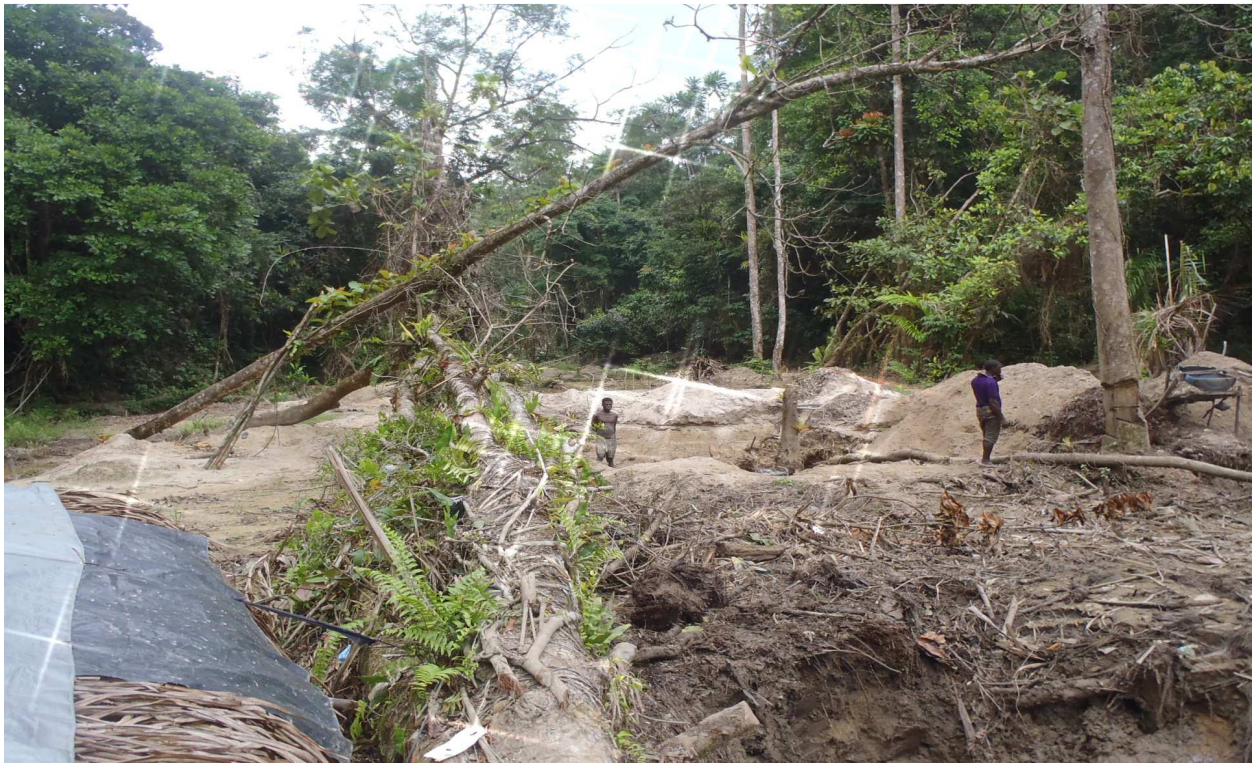
Figure 5. Mining site at Camp 'New Creation Two'