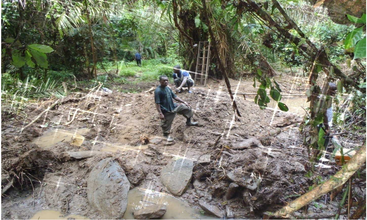
Figure 8. Mining Site at Camp 'One'

Much to our disappointment, WCF was unable to establish an eco-guard program but did manage to support FDA in a difficult period to try to re-establish authority across the park. FDA has recognized the importance of developing a law enforcement strategy for the park, and as such WCF, with other partners, has established a law enforcement committee to develop law enforcement actions and strategies on a national basis, but with emphasis on areas in dire need such as the Sapo National Park.