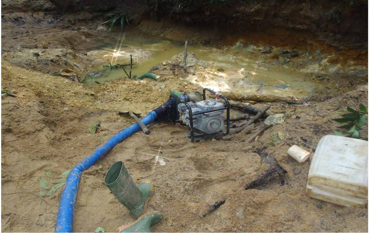
Figure 4. Mining equipment found at Camp 'New Creation One'