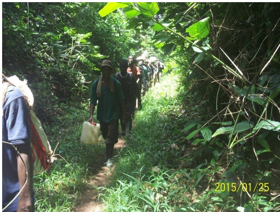
Figure 1. Team of FDA rangers entering the Sapo National Park to lead a law enforcement mission

Despite the recent Ebola outbreak, it was also apparent that poaching inside the park was on the increase. During the patrols, FDA confiscated and burned the meat of 40 animals. When possible the meat was brought to the magistrate courts and burned in front of the communities to show that FDA would no longer tolerate the hunting of wildlife in the Sapo National Park. At this point, FDA did not find any active mining camps within the park, showing the positive impact the rangers are having on ensuring the protection of the park. Due to the urgency of the situation with the miners in the park, it was agreed that time-wise it would not be worthwhile to devise and train the rangers with a new law enforcement strategy. The FDA rangers have been trained in the past by other partners and they followed that protocol to lead their patrols, but also used a targeted approach to deter the miners from returning to their known camps. When the mining equipment was found (Figure 2), it was removed from the park and destroyed by the FDA.