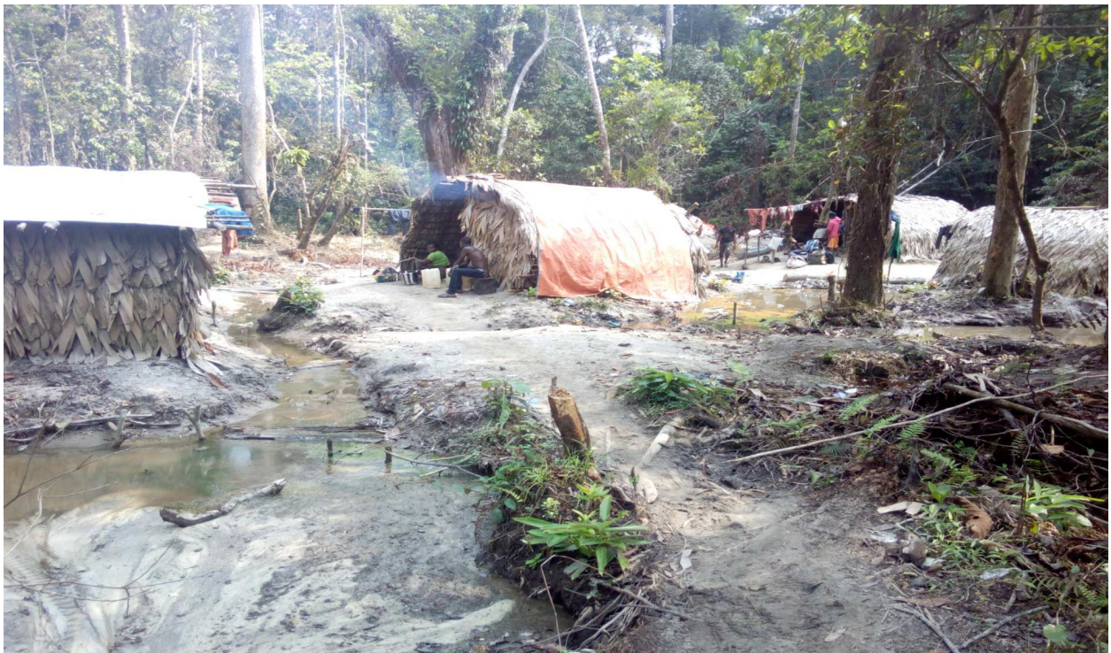
Figure 7. Settlement at Camp 'Beirut'