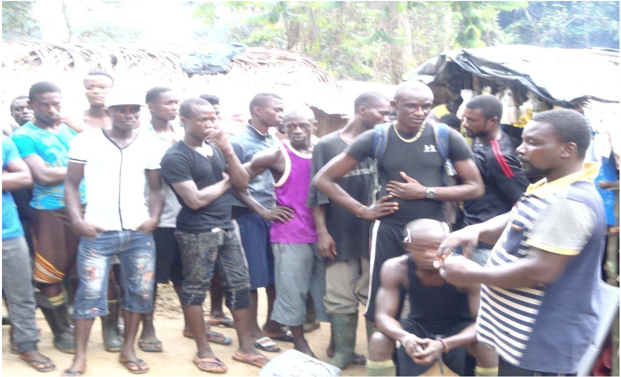
Figure 6. Illegal miners at Camp 'Iraq'