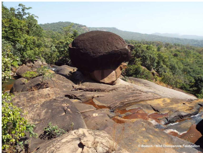
Moyen-Bafing National Park in Guinea